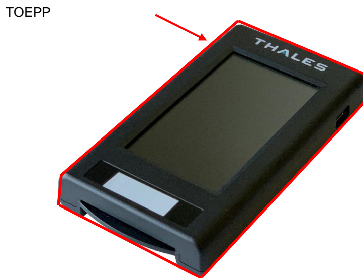
Figure 2-2: Thales Luna G7 Cryptographic Module HW 808-000080-001 and 808-000080-002

The module includes a CR2032, 3V, coin battery, which is excluded from the TOEPP boundary. This battery is used to power the modules real-time clock when not connected through the 5V power interface. The real-time clock is not used to support any approved security functions supported by the module.