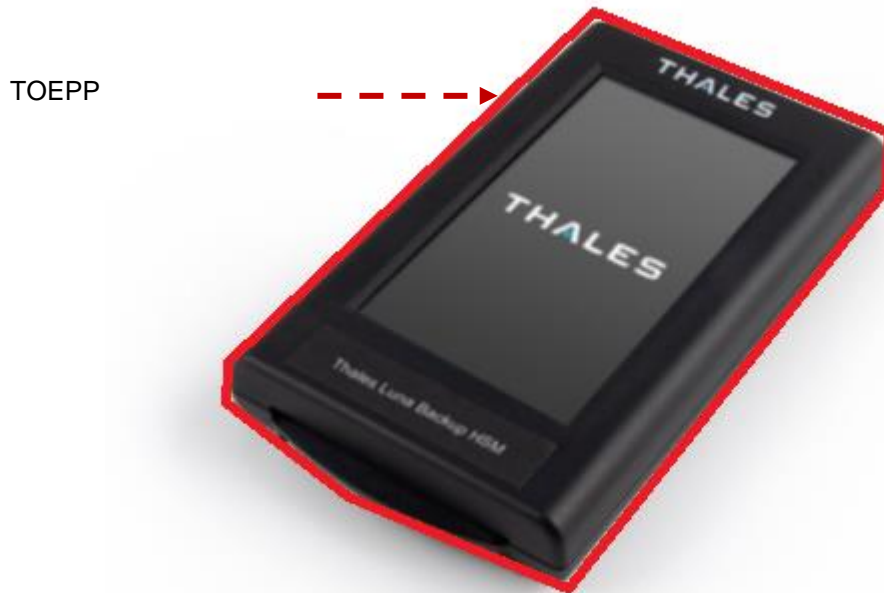
Figure 2-1: Thales Luna G7 Cryptographic Module HW 808-000064-005 and 808-000064-006