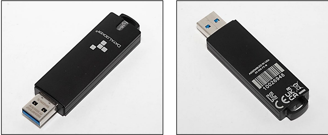
Figure 1 - Cryptographic Boundary

The module is a multi-chip standalone cryptographic module whose outer enclosure defines the cryptographic boundary and Tested Operational Environment's Physical Perimeter (TOEPP) (refer to Figure 1).