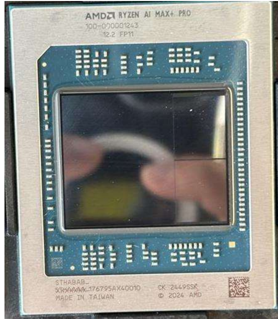
Figure 1: Ryzen AI Max+ PRO 395