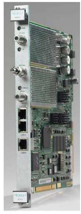
MID1-T Universal Line Card