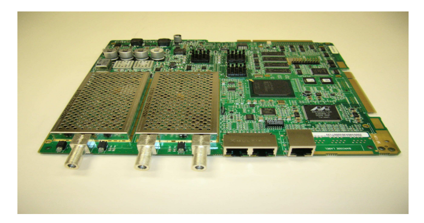
Figure 6 - iConnex-100