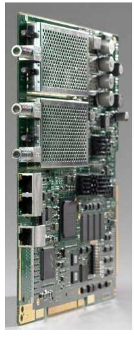
700-T iNFINITI iConnex

700-T iNFINITI iConnex, iConnex-100, and M1D1-T Universal Line Card are PCBs that consist of production grade components and are validated as multi-chip embedded modules.