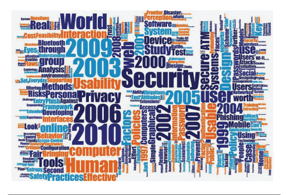
Figure 1. Word cloud of security usability studies topics. The publication year was included in forming the cloud; its size represents the number of papers.

The cloud provides the big picture, but scrutiny of the details reveals a variety of types of investigation. In 2009, Colin Birge an-