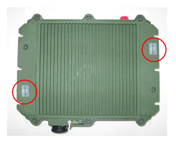
Figure 2 – Tamper-Evident Label Locations for RF-7800W