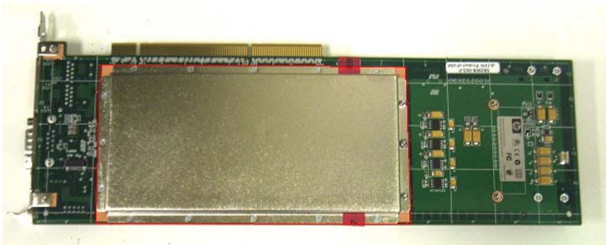
Figure 2: Back side of Atalla Cryptographic Subsystem