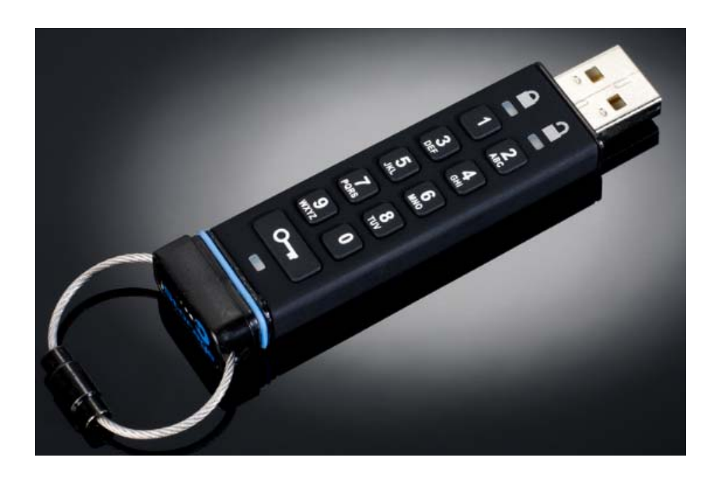
Figure 1 – iStorage datAshur cryptographic boundary showing input buttons and status LEDs