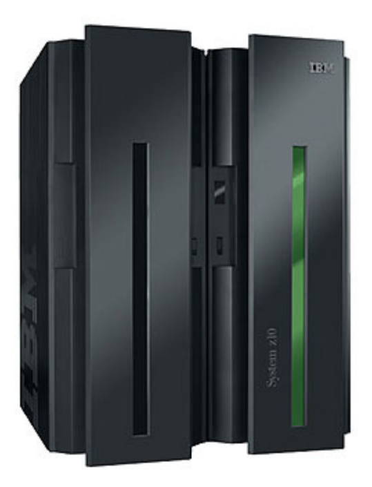
Figure 3: IBM System z10 EC Mainframe Computer.