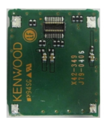
Figure 1 - Physical Form of the SCM

The SCM physical form is depicted in Figure 1, with the cryptographic boundary defined as the surfaces and edges of the assembled SCM printed circuit board.