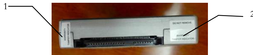
Figure 2: Tamper-Evident Seals