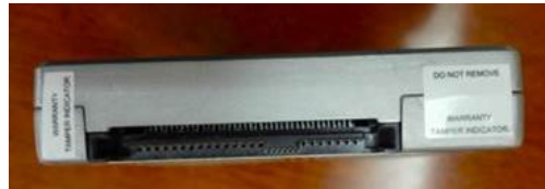
SAS Connector Front View