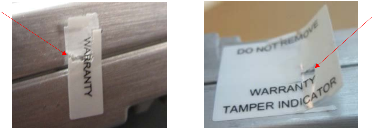
Figure 3: Tamper Evidence on Tamper Seals